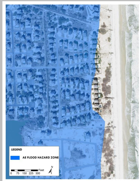
A GIS RENDERED FLOOD ZONE MAP

Please send us an e-mail: gis@currituckcountync.gov